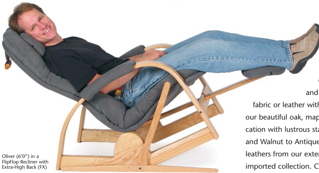
Oliver (6'0") in a FlipFlop Recliner with Extra-High Back (FX)